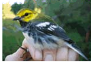
Black-throated Green Warbler